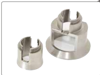
Actuator skirts for a range of substrate thicknesses and bond strengths, on flat or curved surfaces