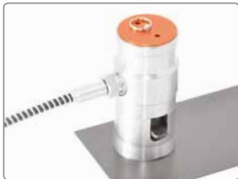
Low height actuator allows access in restricted areas. Safety harness clip prevents accidental damage of surrounding areas during test on vertical surfaces