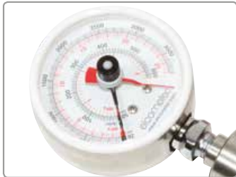
Digital and analogue gauges available for both harsh and hazardous environments

ASTM D4541, ASTM D7234, AS/NZS 1580.408.5, BS 1881-207, DIN 1048-2, EN 12636, EN 13144, EN 1542, EN 24624, ISO 16276-1, ISO 4624, NF T30-606, NF T30-062