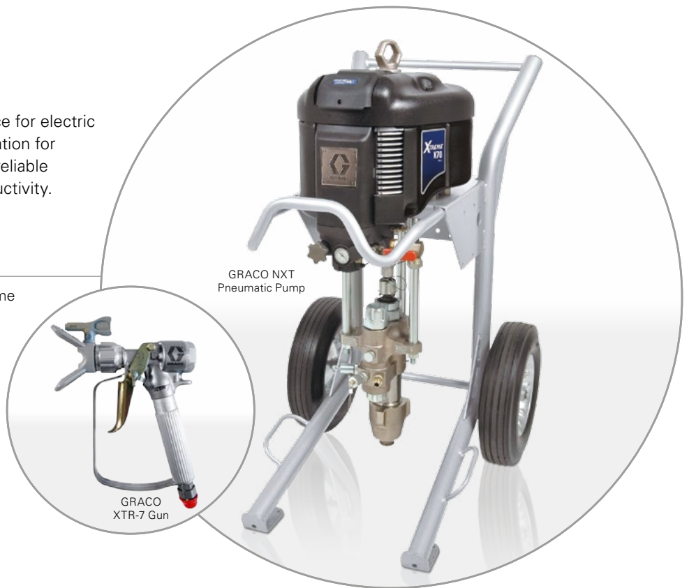
GRACO NXT Pneumatic Pump