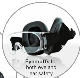
Eyemuffs for both eye and ear safety