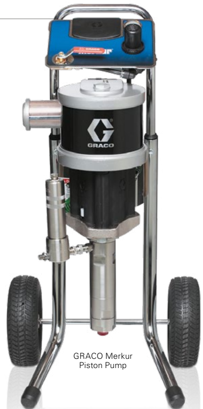
GRACO Merkur Piston Pump