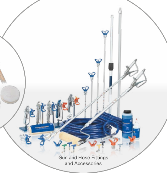
Gun and Hose Fittings and Accessories