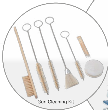
Gun Cleaning Kit