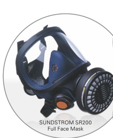
SUNDSTROM SR200 Full Face Mask