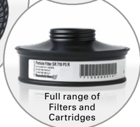
Full range of Filters and Cartridges