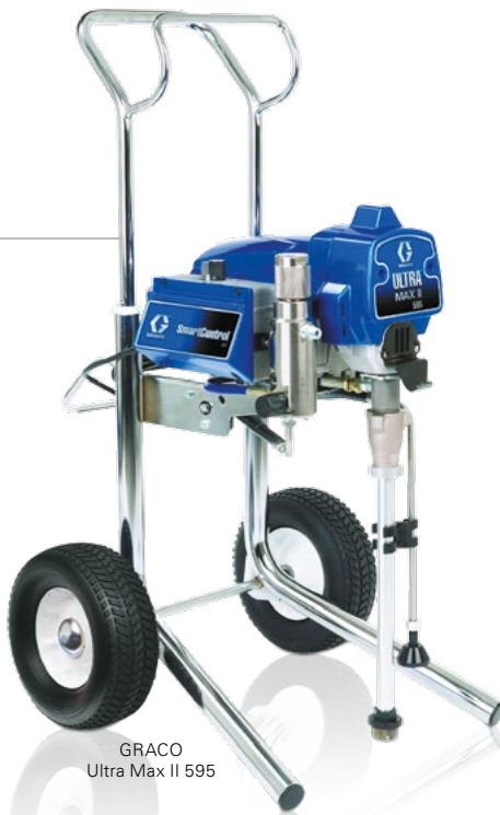
GRACO Ultra Max II 595