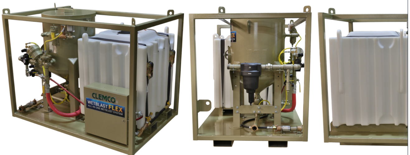
Wetblast FLEX™: All-in-One Wetblast System

Packages include FLEX Base Unit plus 50ft x 1¼" ID Supa™ hose fitted with nylon holder and nylon coupling, 7/16"-orifice silicon-carbide-lined rubber-jacketed nozzle, Apollo 600 HP DLX NIOSH-approved supplied-air respirator, ClemCool™ air conditioner, CPF-20 breathing-air filter, 50 ft respirator hose, Apollo 600 outer lenses (pk of 25), Apollo 600 intermediate lenses (pk of 5), 1 pair leather gloves, abrasive-trap screens (6), coupling gaskets (pk of 10), nozzle washers (pk of 10), nylon ties (8).