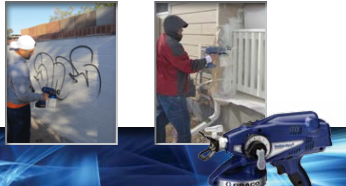
TRUECOAT PRO-X II HANDHELD AIRLESS SPRAYERS