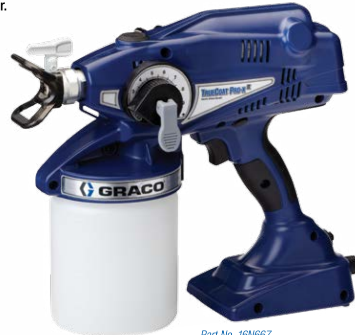
Part No. 16N667