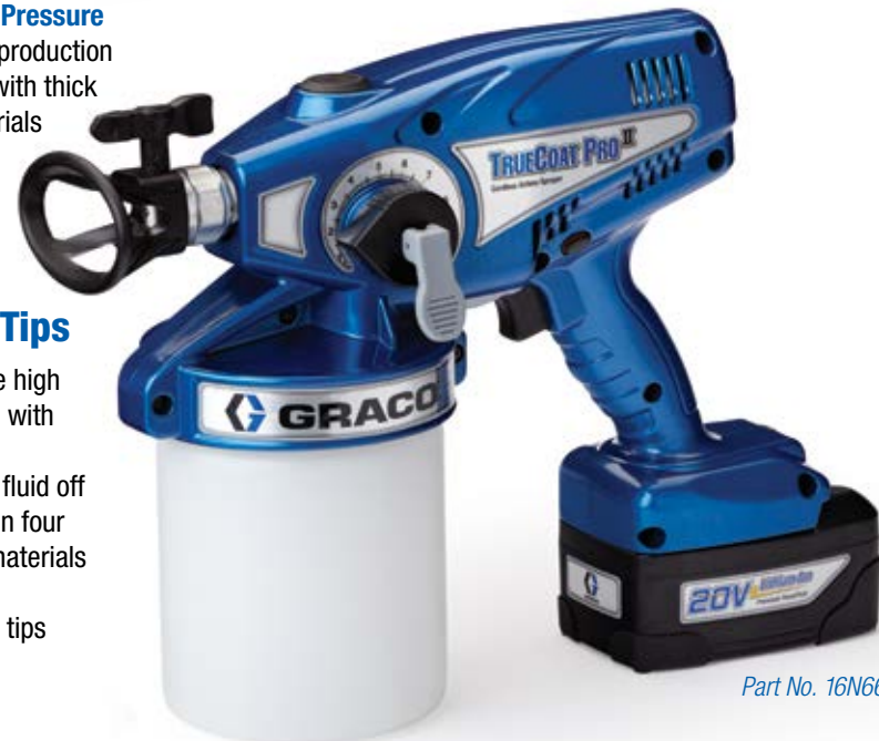
Part No. 16N669