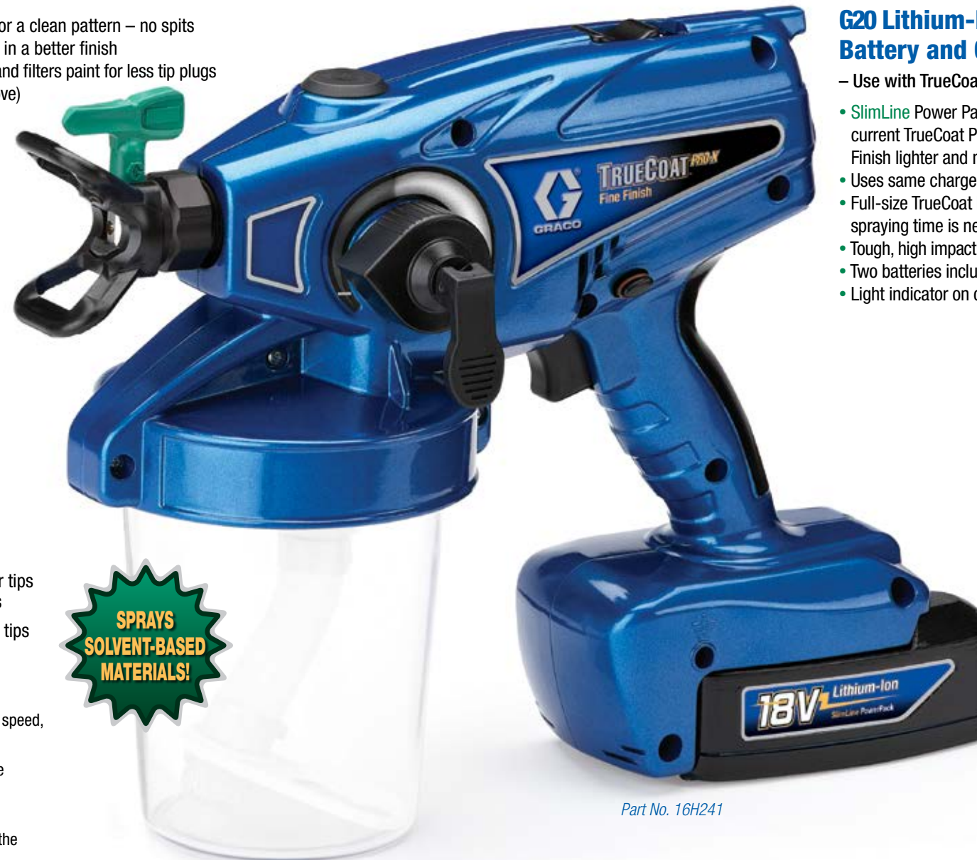
Part No. 16H241