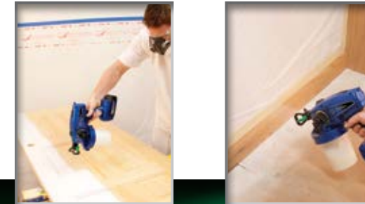
TRUECOAT PRO-X FINE FINISH

Walls, Ceilings, Doors, Siding, Garage Doors, Fences, Shutters, Decks