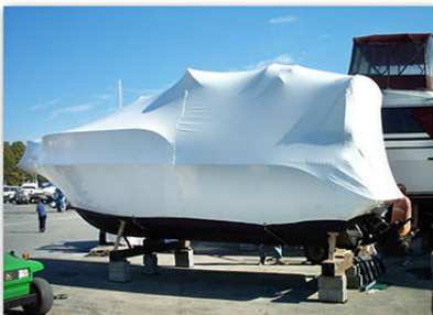
Shrink Wrap stock sizes