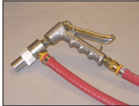
SG 300 - Portable Blast Gun with Hopper